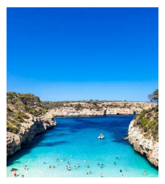
MARBELLA Elite golfing, five-star resorts, and vibrant nightlife.

Scenic coastal retreats, private villas, and ultimate relaxation.